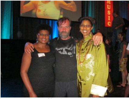
Mom, Wim Hoff (The Ice Man) and me at the Orlando Qi Gong Conference

Qi Gong (pronounced chi-kung) is a 5000 year old internal martial art. “Qi” means energy or life force and “Gong” means cultivation. Qi Gong is the practice of learning to cultivate and rejuvenate your internal energy using slow, graceful movements and a variety of slow breathing techniques. The practice of Qi Gong builds muscle strength, while reducing stress and enhancing energy. Its numerous health benefits are profound, including: