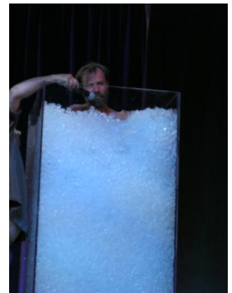
Wim Hoff sat in ice practicing tumo breathing for over an hour!